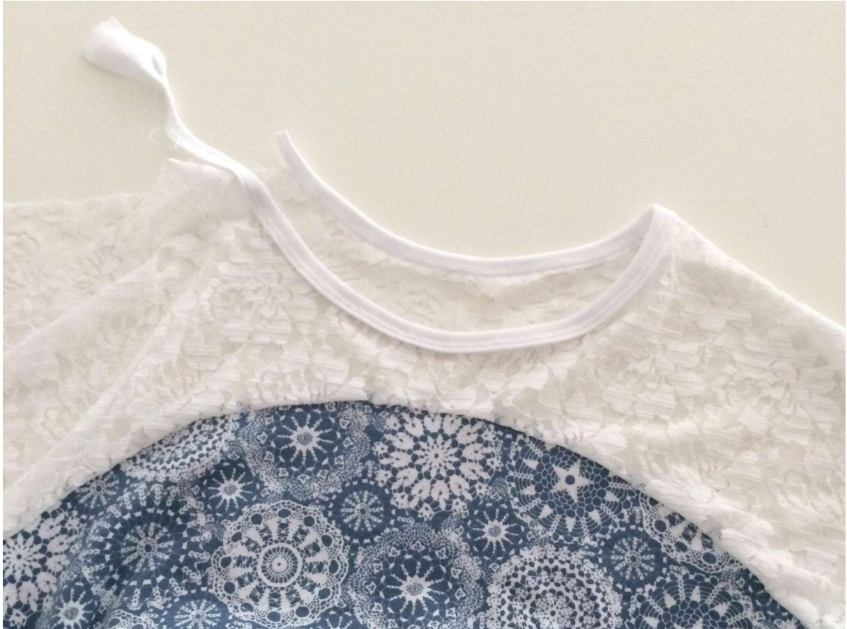
Binding of neck: Bind the neck.