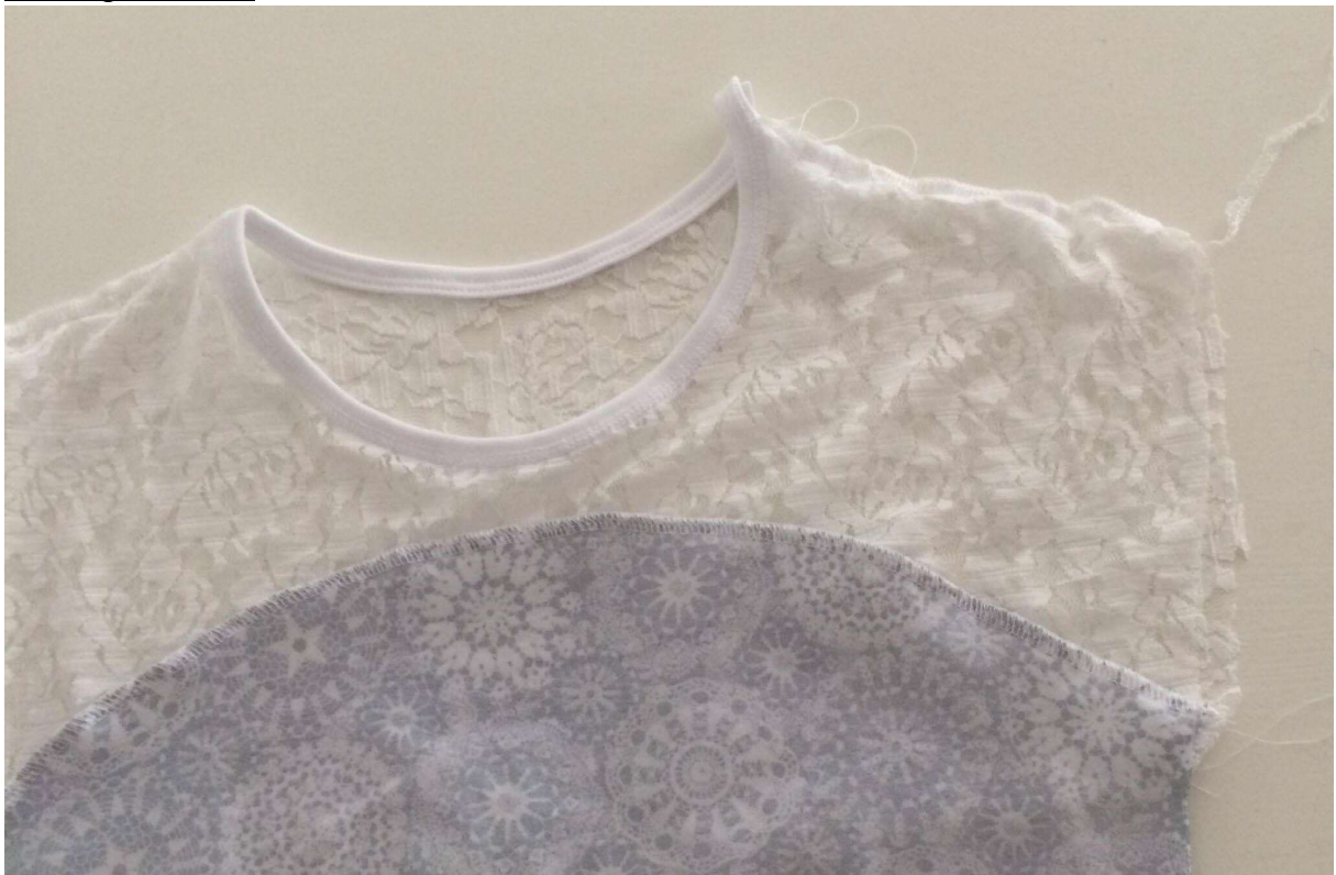
Binding of neck: Sew second shoulder seam.