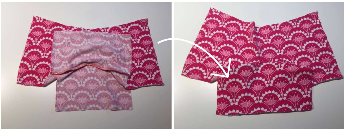
Fold the top crotch piece.