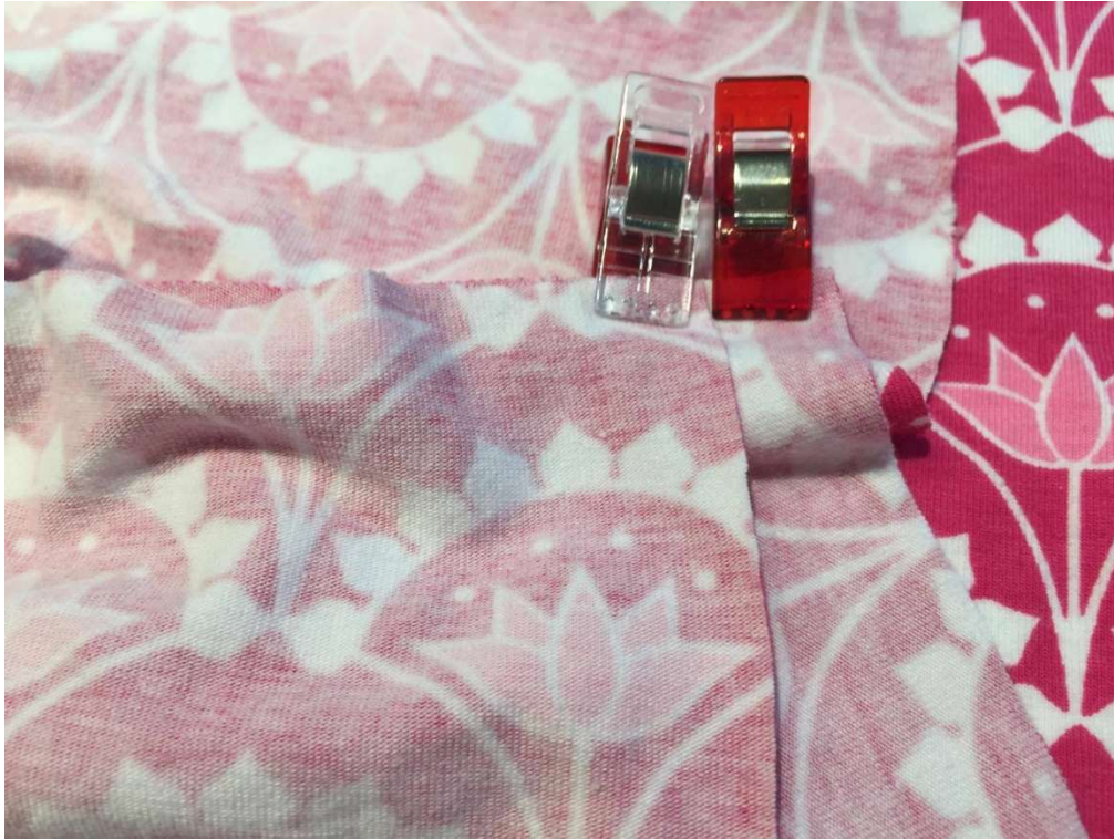
Picture of the leg/crotch pieces for hemming of the legs.