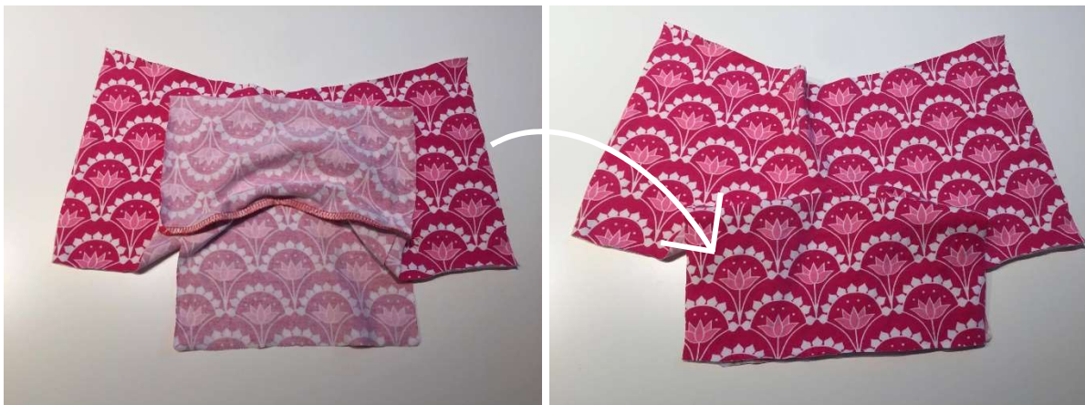
Fold the top crotch piece.