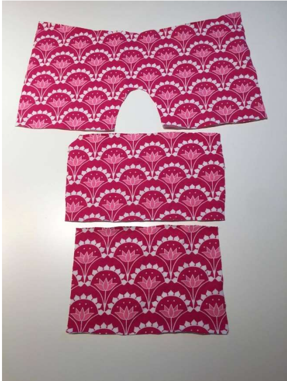
Inner crotch piece at the bottom.

Hem the legs: No extra hem allowance is needed for the inner crotch piece as it ends up in the hem of the outer crotch piece.