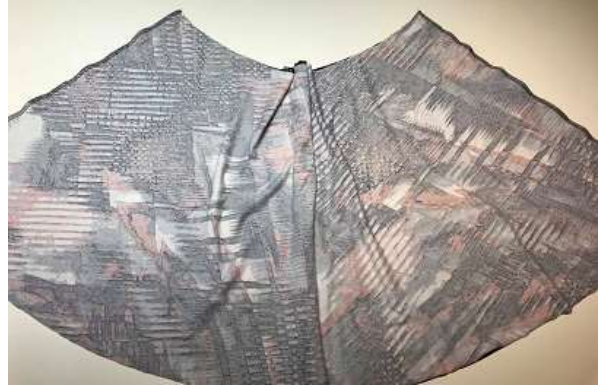
Skirt with four parts ( not placed on fold ). Skirt with two parts ( placed on fold ).

Put the skirts right sides together. Stitch the side seams.