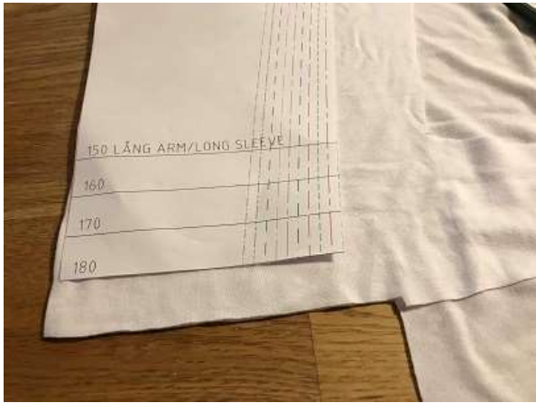
Cut for hem.