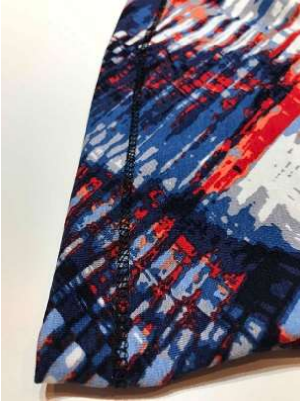
Hem the bottom.