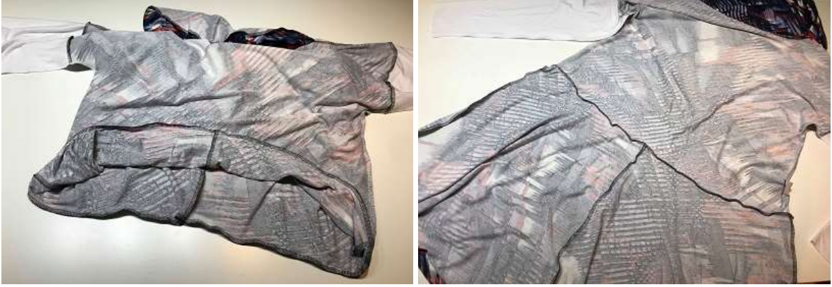
Stitch together. (pictures show skirt with four pieces)