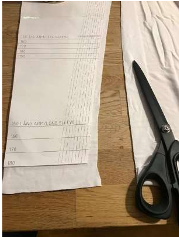
The shape makes it easy to hem.