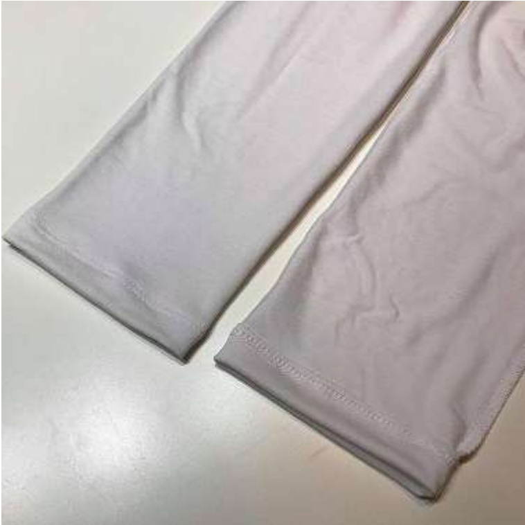
Hem the sleeves.