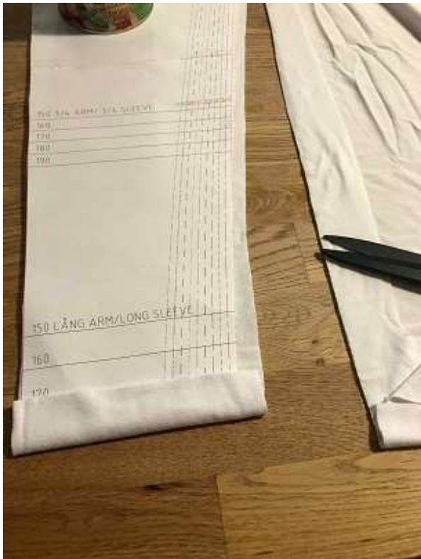
Cut the side of the sleeve.