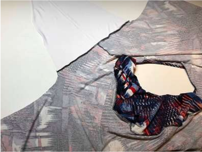
Stitch the sleeve.