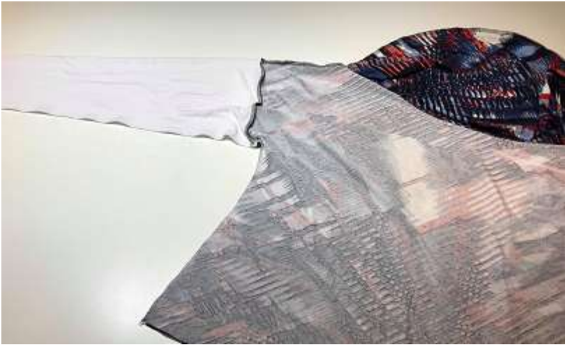
Stitch the side seams.