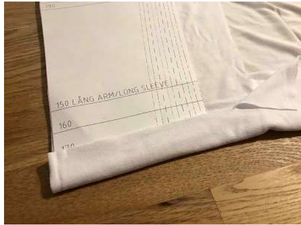
Fold the fabric.