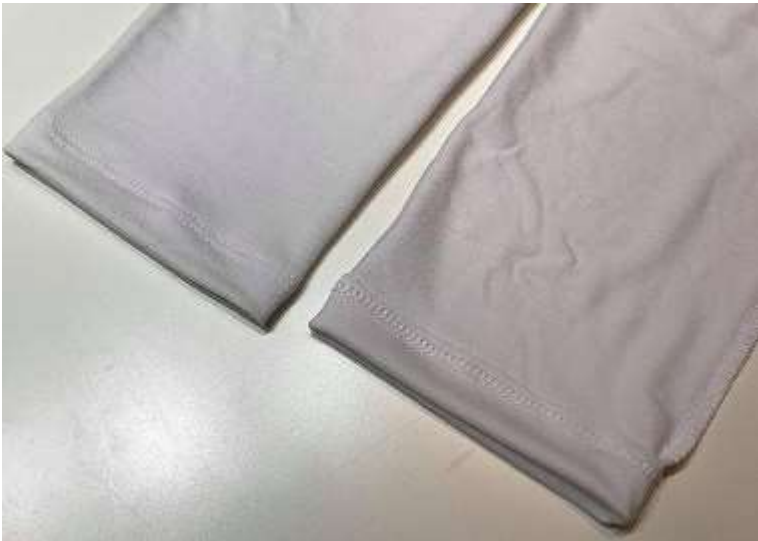
Hem the sleeves.