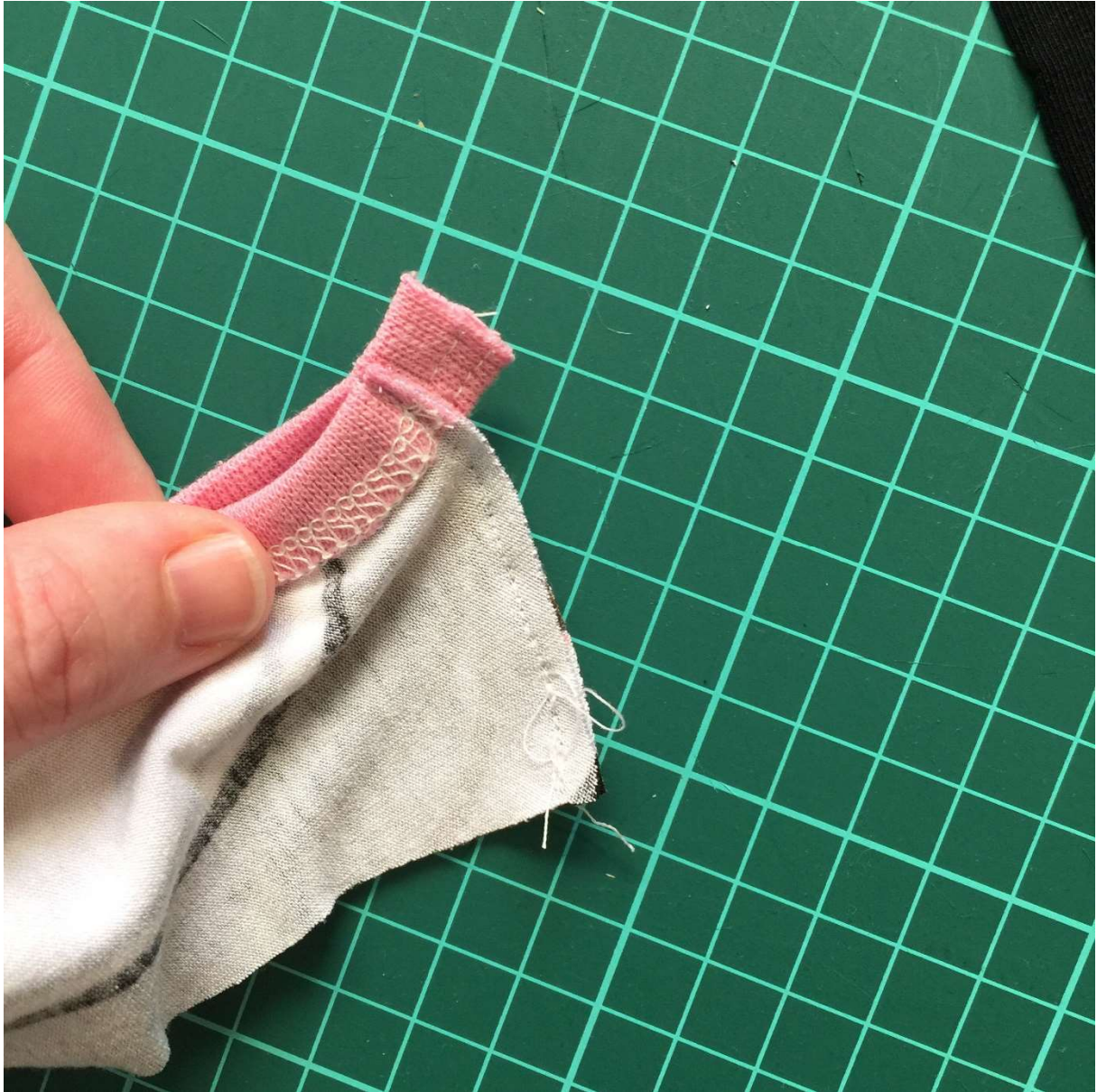
Knit binding: Stitch the other shoulder.