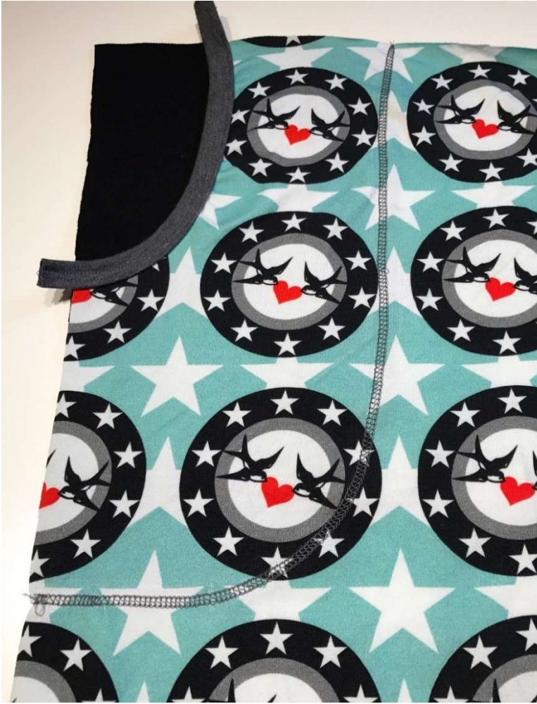
Attach the pockets with a decorative stitch.